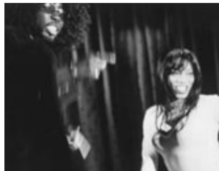
Venus Boyz, pg. 31