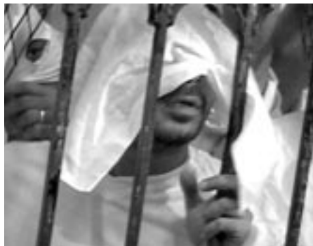
Dangerous Living, pg. 22