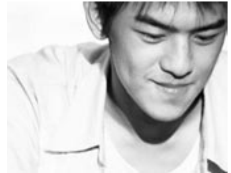
Blue Gate Crossing, pg. 16