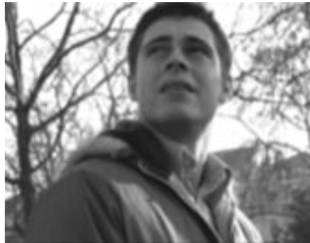
A.K.A., pg. 5