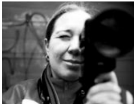
Don't Worry, It'll Probably Pass, pg. 23