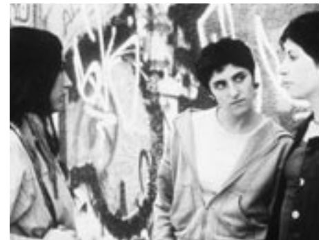
Suddenly, pg. 29

The following short films have been selected for consideration: Vamonos (pg. 32), Judas Kiss (pg. 31), Precious Moments (pg. 32), Love Life (pg. 32), Short White Pleated (32), Sexo (pg. 31).