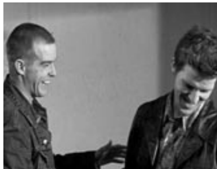
9 Dead Gay Guys, pg. 26