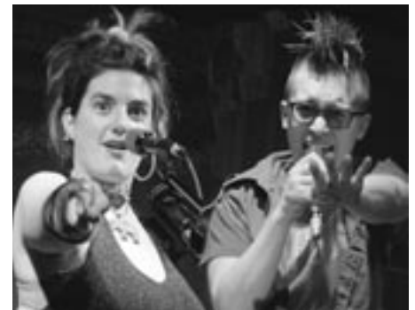
Radical Harmonies, pg. 29