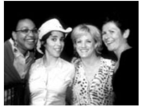
Laughing Matters, pg. 24