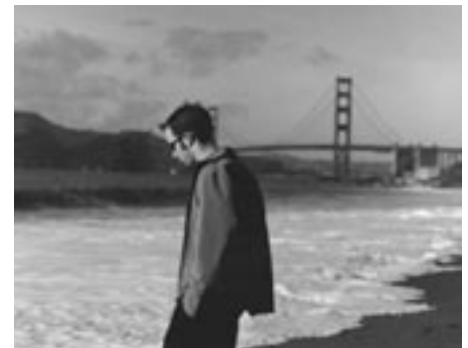
The Gift, pg. 24