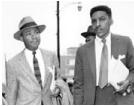
Brother Outsider, pg. 16